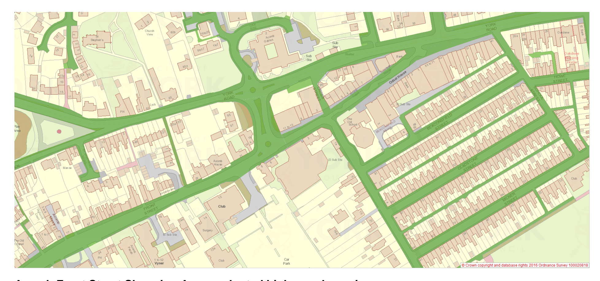
Acomb Front Street Shopping Area – adopted highway shown in green